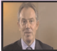
Tony Blair Prime Minister