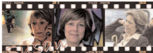
missdorothy.com Patron Lynda Bellingham

Watch Over Me tackles the tough issues that young people are concerned about and gives the emergency services and other agencies an opportunity to take part in their discussions. It encourages young people to make their own strategies for dealing with risk and helps them develop a voice, so they are never afraid to speak up and know where they can ask for help.