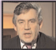
Gordon Brown Chancellor