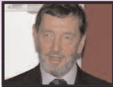
David Blunkett Sheffield MP