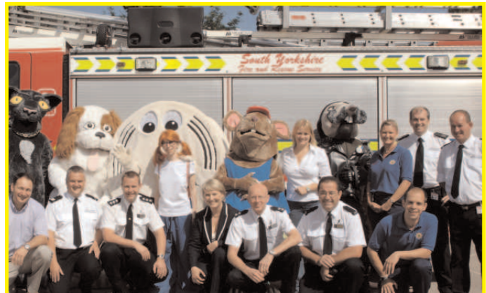
Special thanks to Police, Fire and Education in South Yorkshire, 1st in the country to reach every child. Hexthorpe Primary school, Doncaster is a lead missdorothy school.

The missdorothy.com foundation is recognised by the United Nations raising awareness of the human rights of children and a new education programme called SCREAM helping to bring an end to child labour.