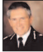
Meredydd Hughes Chief Constable