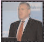
Vernon Coaker Home Office